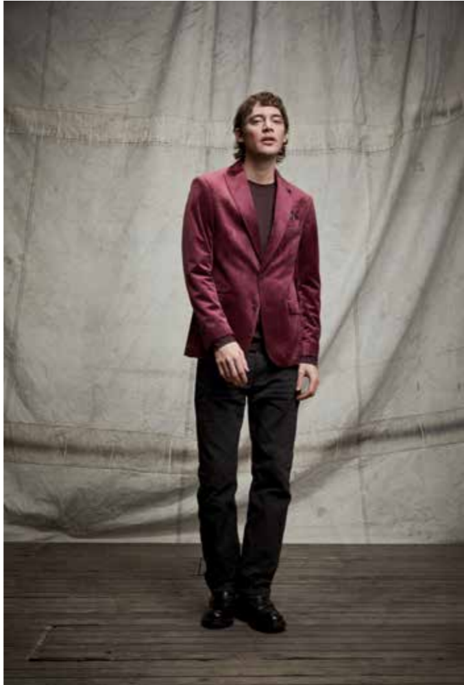
Evening capsule blazer 7934-27-5148-370