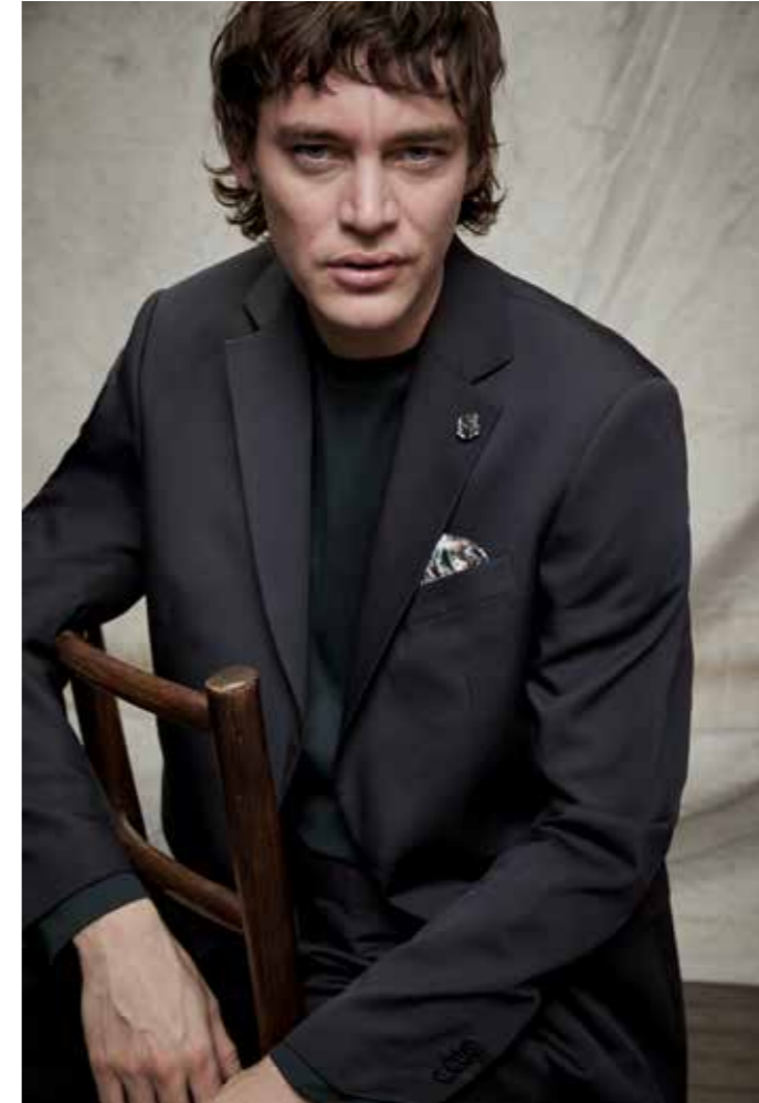
Split suit 7934-3-5256-670 3938-2-5256-670