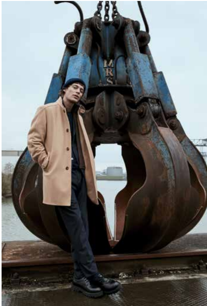
Coat and split suit 5970-3-5285-430 7847-14-5250-680 3988-1-5250-680