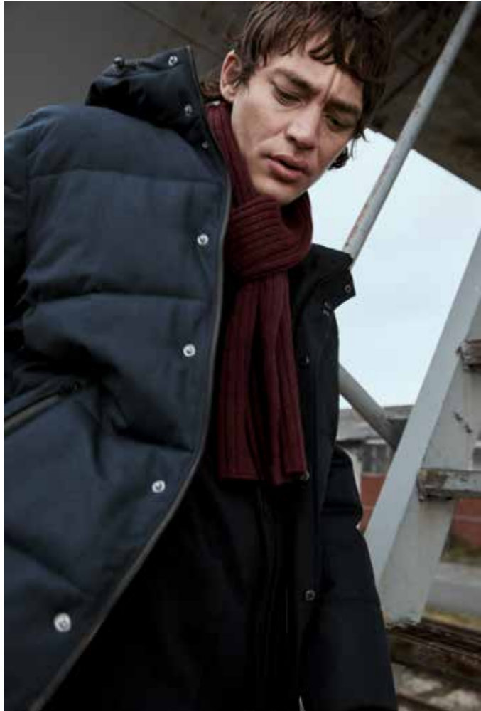
Outerwear jacket 6988-0-5276-680