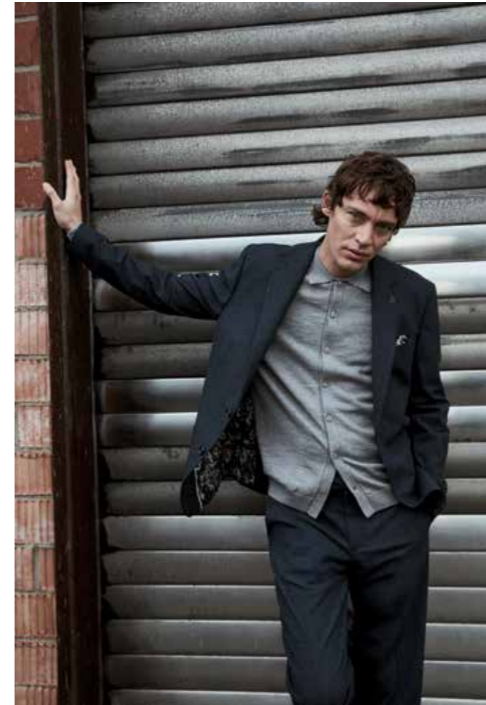
Split suit 7934-3-5255-680 3938-2-5255-680