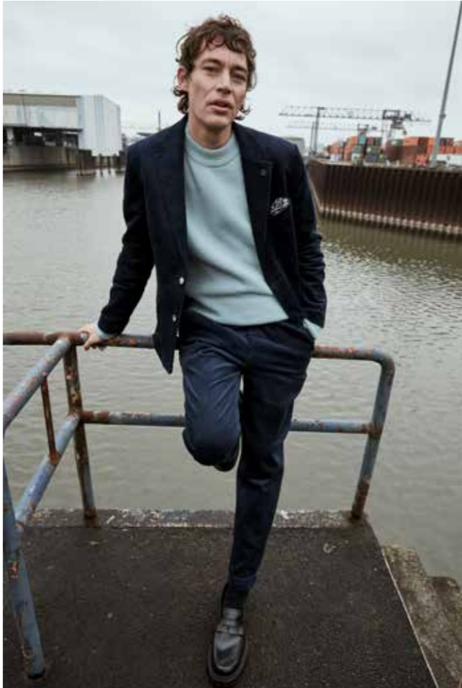
Split suit 7847-1-5260-680 3988-1-5260-680