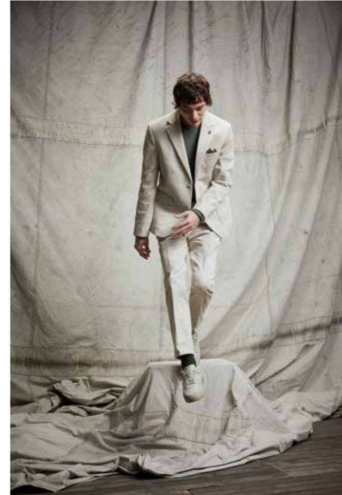
Split suit 7847-1-5260-60 3988-1-5260-60