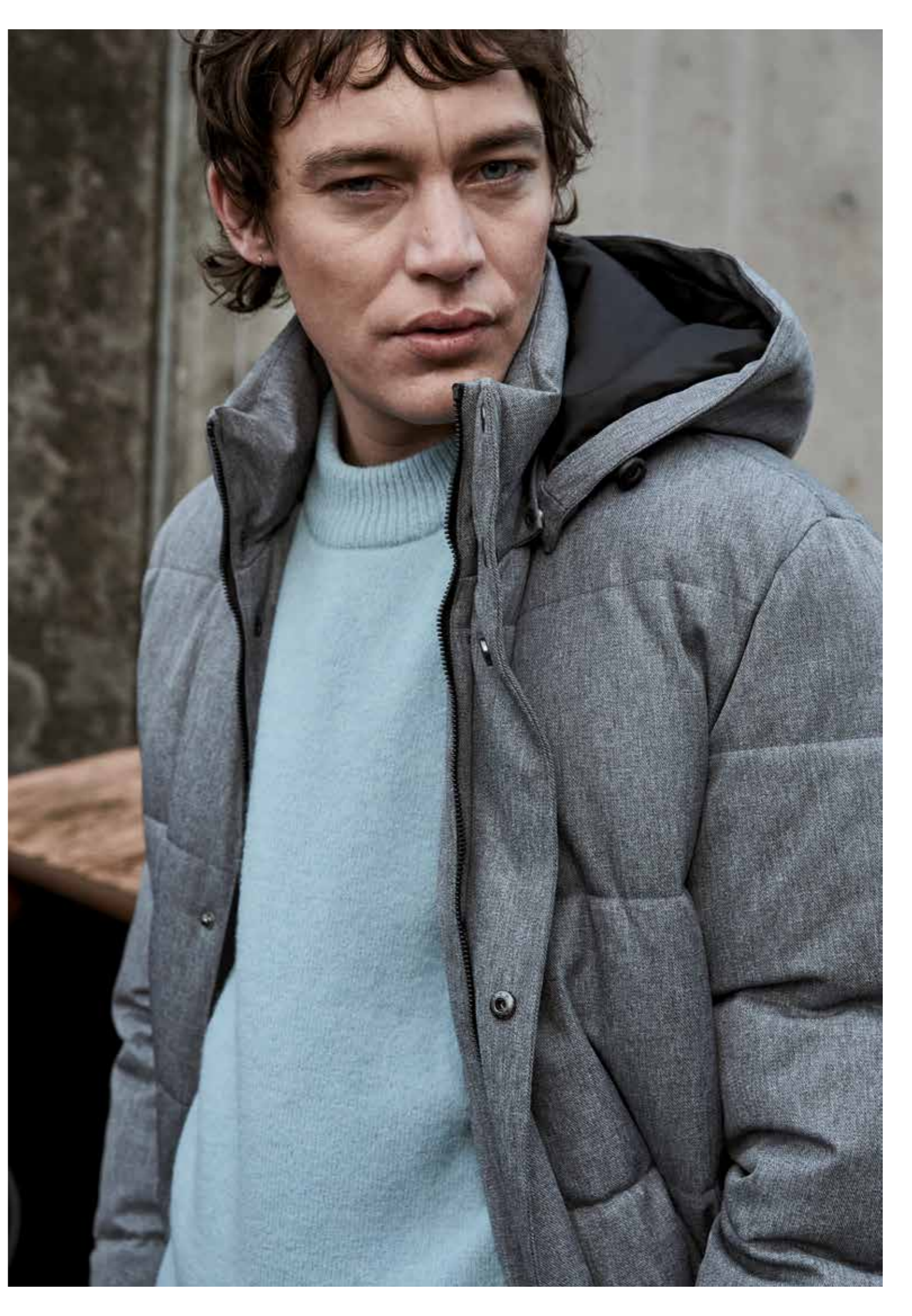
Outerwear jacket 6987-0-5276-740