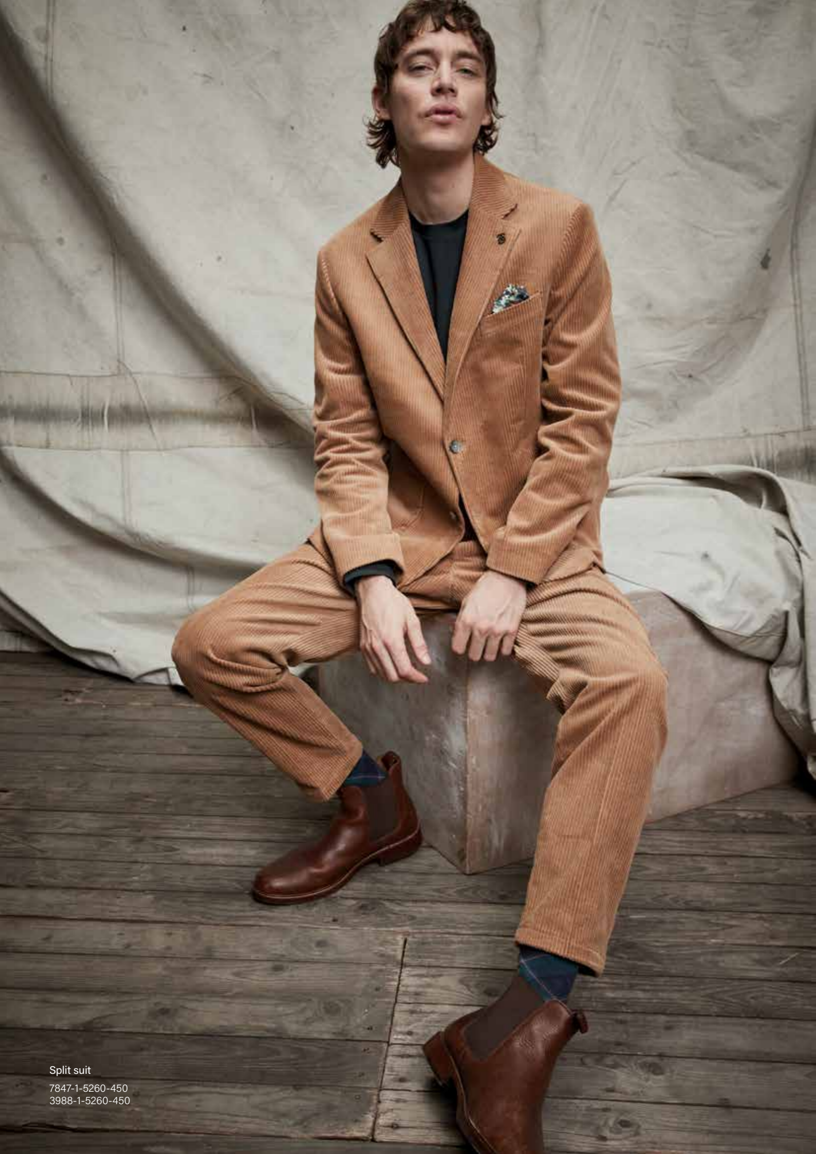
Split suit 7847-1-5260-450 3988-1-5260-450