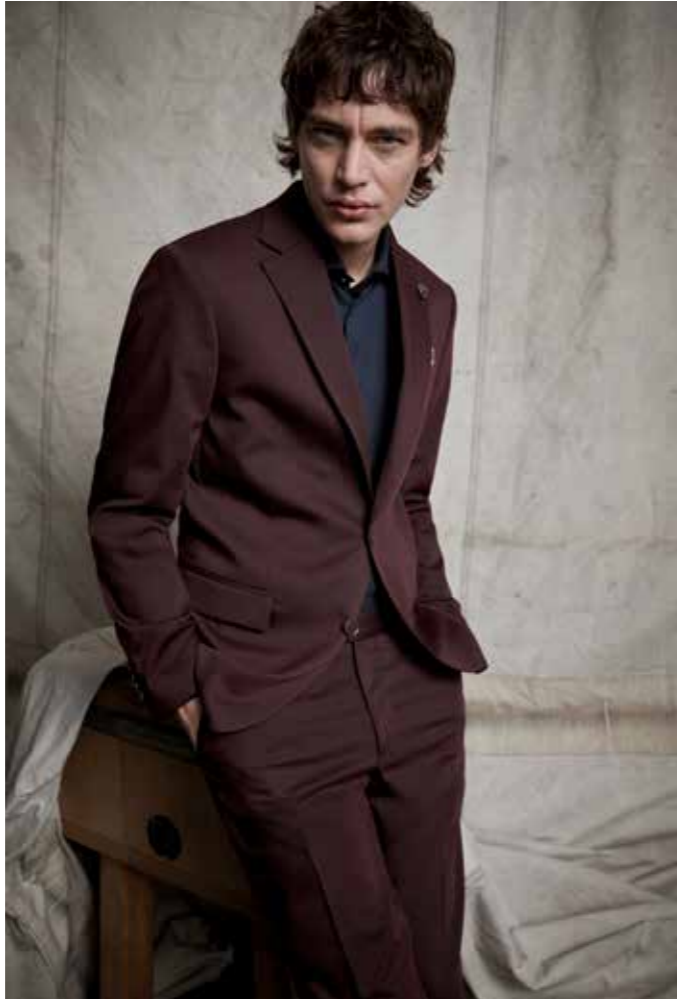
Evening capsule blazer 7934-3-5256-270 3938-2-5256-270