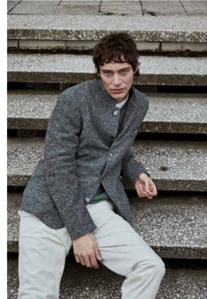
Cardigan style and trousers 7837-7-5173-740 3988-1-5260-60