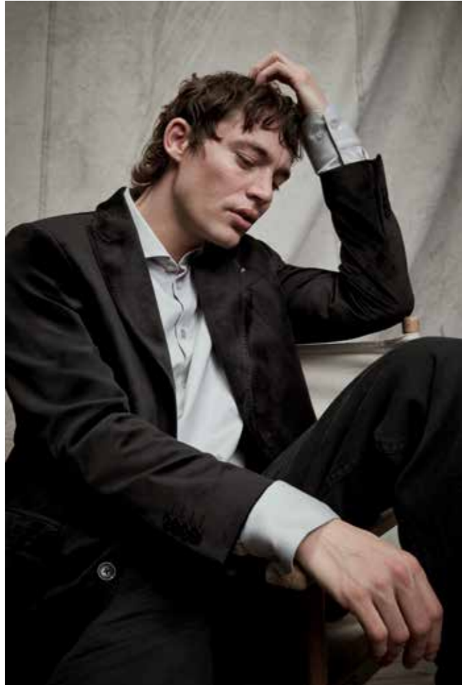
Evening capsule blazer 7934-27-5148-790